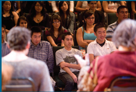
Students attend a post-show discussion.

A FTER YEARS OF PLANNING, 15 months of construction, and the extraordinary support of countless angels, A Noise Within is poised to reach a momentous milestone—and we are going to celebrate not one, but two of them: the completion of A Noise Within's new and permanent home for the classics, and our 20th season producing great world drama!