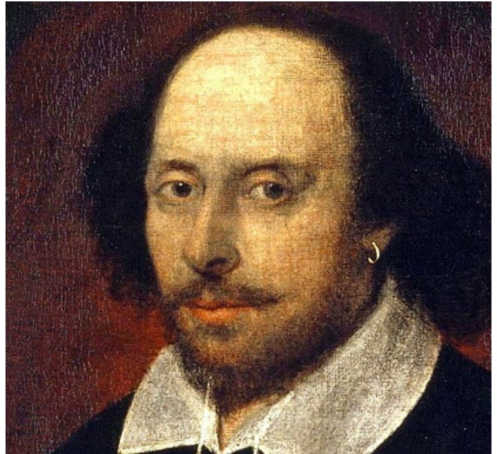
Portrait of William Shakespeare by John Taylor 1610

Agincourt occurred roughly a month after the siege of Harfleur, even though the play seems to suggest that these events were much closer. Again, Shakespeare's depiction of the battle is largely true to history, though Shakespeare, possibly for higher dramatic effect, inflated the numbers of the French and lessened the numbers of the English. Shakespeare even includes one of Henry's most controversial actions, the execution of French prisoners during the battle. However, there is no evidence to support the French slaughter of British boys, included by Shakespeare perhaps to lessen the impact of Henry's killing of prisoners.