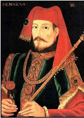
Portrait of Henry IV painted c. 1600