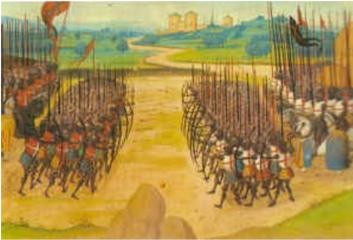
The Battle of Agincourt, 15th-century miniature, Enguerrand de Monstrelet.