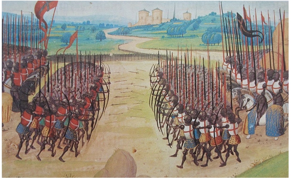
Battle of Agincourt, French manuscript illumination, early 15th century

Henry V is one of Shakespeare's history plays, estimated to be written around 1599. It depicts events during the Hundred Years' War—a series of conflicts over the succession of the French throne between England and France that occurred 1337 to 1453—and centers on the Battle of Agincourt which took place in 1415.